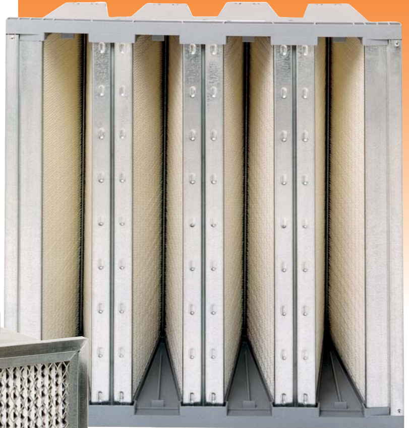
Servacell VA GT