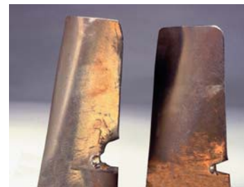
Severely damaged turbine blades seriously affect power output.

ServaCell VA GT and ServaCell GT filters provide high efficiency filtration to prevent fouling and damage to turbine blades. Clean inlet air helps keep units operating at like-new efficiency. No loss of output efficiency due to dirt deposits or blade damage